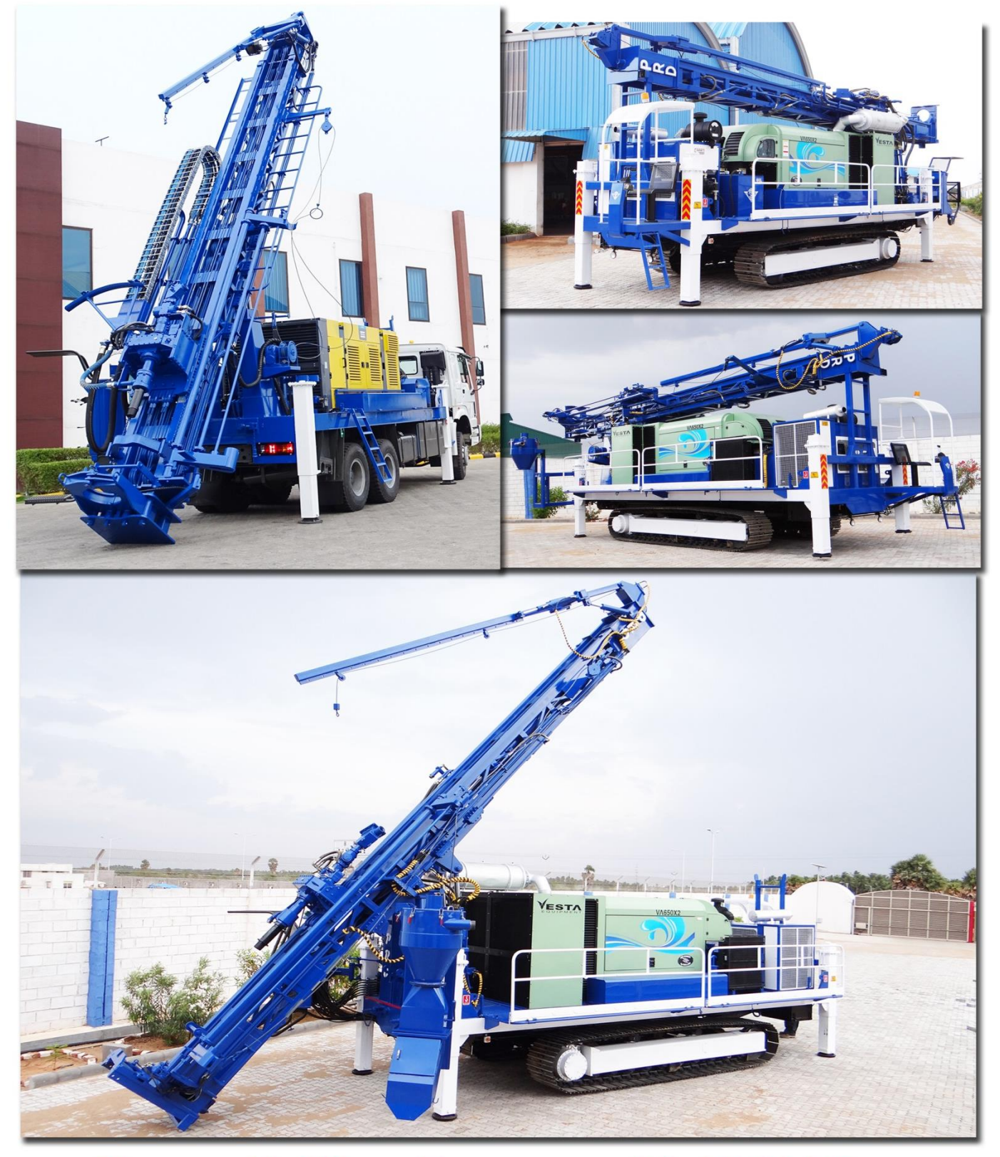
Happy Drilling Forever with PRD Rigs