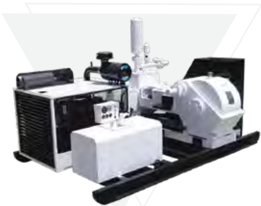
PRD Engine driven Mud pump