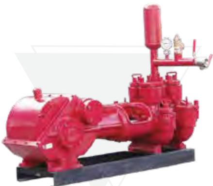
PRD Hydraulic driven Mud pump