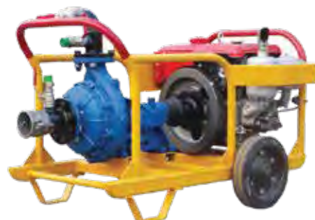
PRD Centrifugal Mud pump