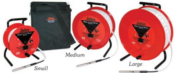
Model 101 Water Level Meter Reels

* Polyethylene tapes are only available in these lengths